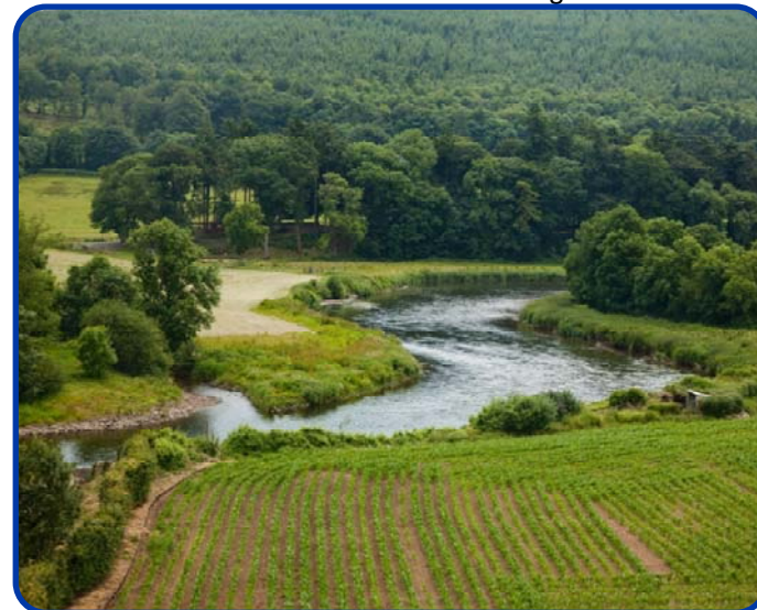
Bend in the River Suir at Poulakerry

theme or by place; they can download information to mobile devices and consult it when visiting the area.